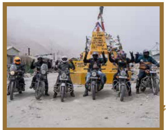
Shot at Chang La (RNR Season 2021)

Day Highlights: Chang La(Pass), Thiksey monastery, Shey Palace, Night stay in Leh