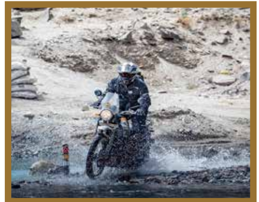
Shot in Zaskar (RNR Season 2021)

Distance: App. 180 kms Ride Time: App. 7 hrs Day Highlights: Wanla (Pass), Singe La (Pass), Lingshet, Zangla (Pass), Night stay in Padum