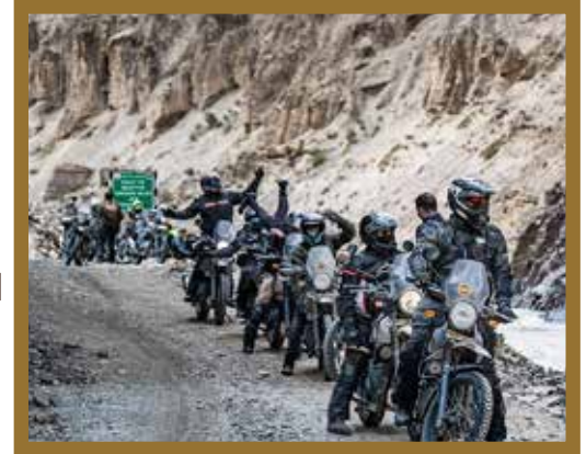
Shot at Zaskar (RNR Season 2021)

The routes via Zaskar Valley to Manali are a perfect example to prove this point. It will give you that extra adrenaline rush that you have been dreaming for a while. Be prepared for a ride of your life-time.