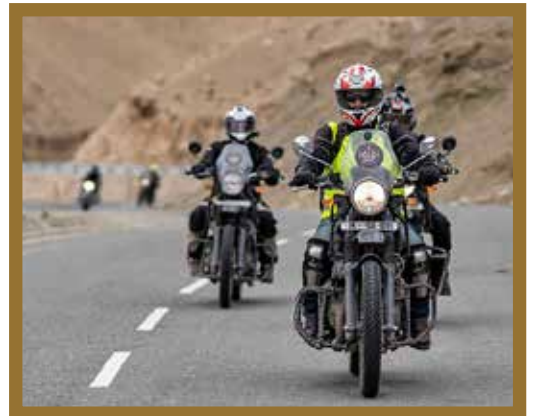
Shot near Khardung La (RNR Season 2021)

Day Highlights: The mighty Khardung La (Pass), Diskit Monastery, Buddha Statue, Bactrian camels, Sand Dunes Night stay in Nubra Valley