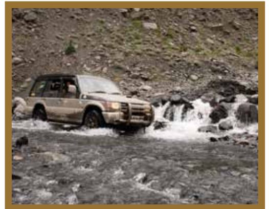
Shot in Manali (RNR Season 2021)

Day Highlights: Long drive in an SUV to the beautiful mountains of Kullu. On the go breakfast & lunch. Night stay in Manali