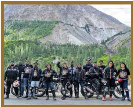
Shot at Kargil (RNR Season 2021)