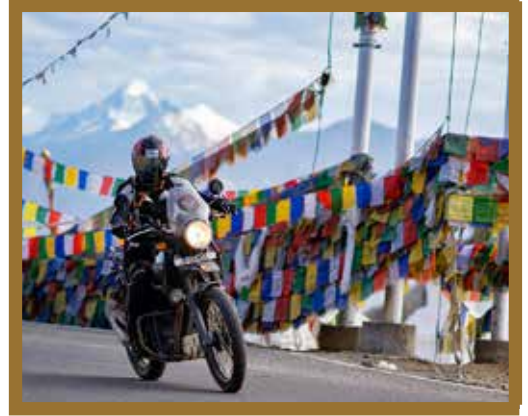
Shot at Shanti Stupa (RNR Season 2021)

Distance: App. 115 kms Ride Time: App. 4 hours Day Highlights: Shanti Stupa, Hall Of Fame, Magnetic Hill, Indus Zaskar Confluence, Lamayuru Monestary, Night stay in Lamayuru