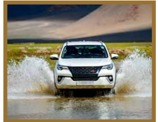
Shot in Manali (RNR Season 2021)

Day Highlights: Long drive from Manali to Delhi NCR in an SUV. Reach hotel by the evening. Enjoy the memories of Ladakh with co-travellers.