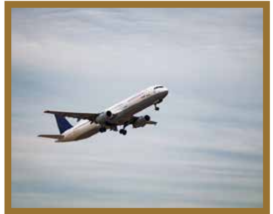
Shot at Delhi airport (RNR Season 2021)

Check-in at the hotel. Meet & greet our team & fellow riders.