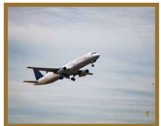
Shot at Delhi (RNR Season 2021)

Pick-up in an SUV car. Check-in at the airport. Bid adieu to India. Fly back home with a life-time memories.