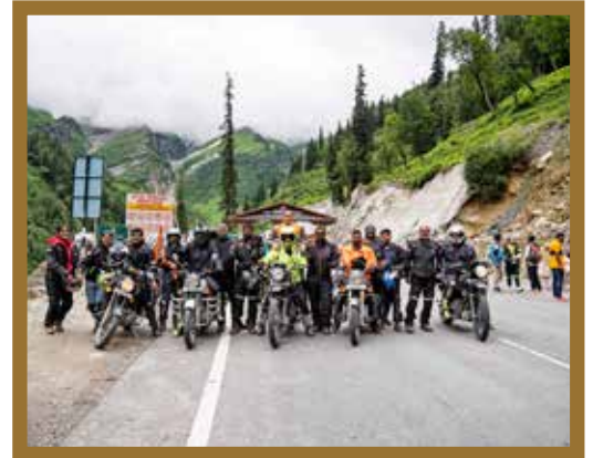
Shot at Atal Tunnel (RNR Season 2021)

Enjoy photoshoot in Lahual Valley, Atal Tunnel, Party time, Night stay in Manali