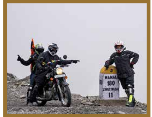
Shot near Zingzing Bar (RNR Season 2021)

Day Highlights: Deepak Tal, Suraj Tal, The mighty Baralachala (Pass), Night stay in Sarchu