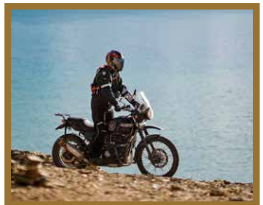
Shot at Pangong Tso (RNR Season 2021)

Day Highlights: Agam-Shyok Route, Marmot Point, Lake visit, Night stay in Pangong Lake