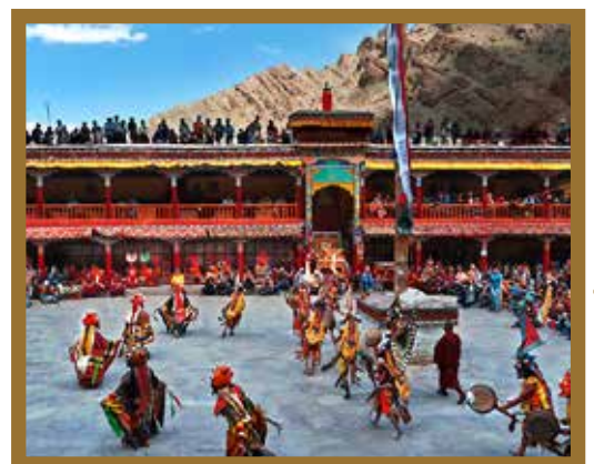
Shot in Ladakh (RNR Season 2021)

Day Highlights: Enjoy Local Culture, Restaurants, Leh Market Walk and Shopping, Night stay in Leh