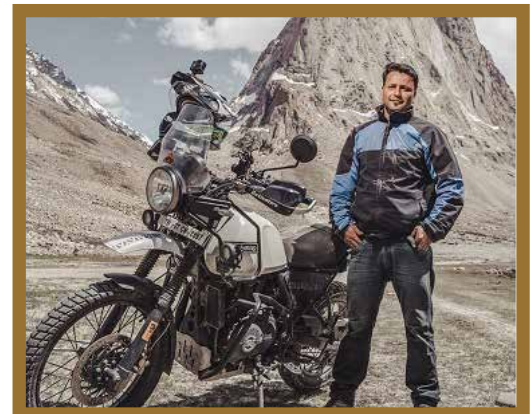
Shot at Gonbo Rongon (RNR Season 2021)

Distance: App 120 kms Ride Time: App. 5-6 hrs Day Highlights: Hardcore off-roading, Purne, Gonbo Rongon, Shinku La (Pass), Darcha, Night stay in Jispa