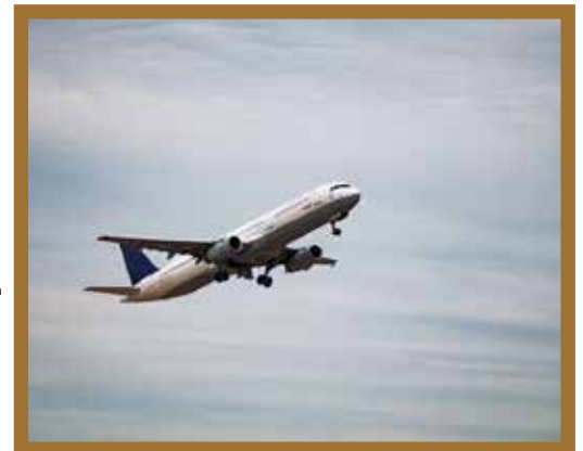
Shot at Delhi (RNR Season 2018)