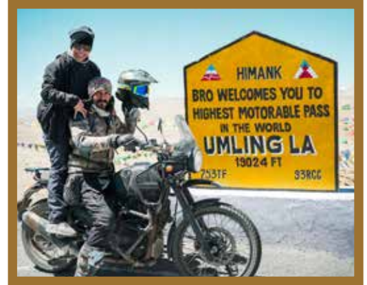
Shot at Umlingla (RNR Season 2023)