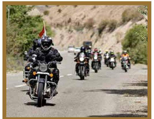
Shot at Dras (RNR Season 2021)