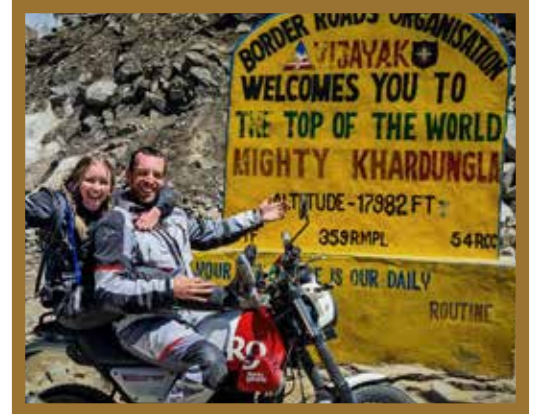
Shot at Khardung La (RNR Season 2021)