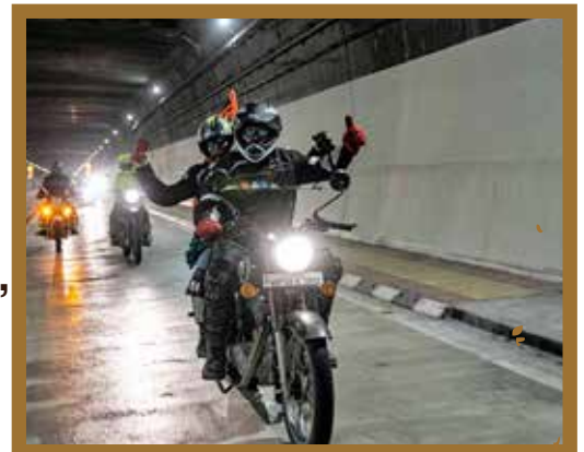
Shot at Atal Tunnel (RNR Season 2021)