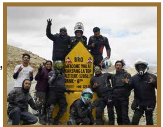
Shot at Kaksang La (RNR Season 2024)