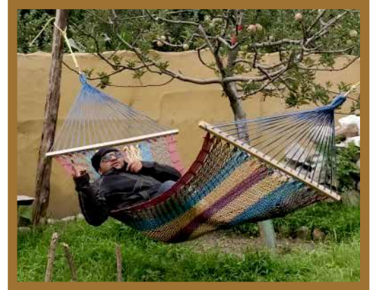
Shot at Manali (RNR Season 2021)