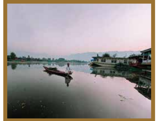
Shot at Dal Lake enroute (RNR Season 2018)