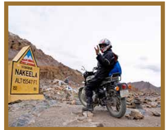
Shot at Nakeela (RNR Season 2021)