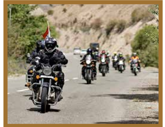
Shot near Dras (RNR Season 2021)