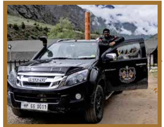
Shot at Jispa (RNR Season 2021)

We always keep a four wheeled support vehicle for on-the-go convenience. It can either be an iSuzu or a Mahindra vehicle. This carries your luggage, oxygen cylinders, extra petrol, mechanical support & spare parts for a worry-free riding experience.