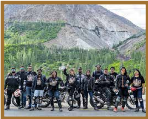
Shot at Kargil (RNR Season 2021)