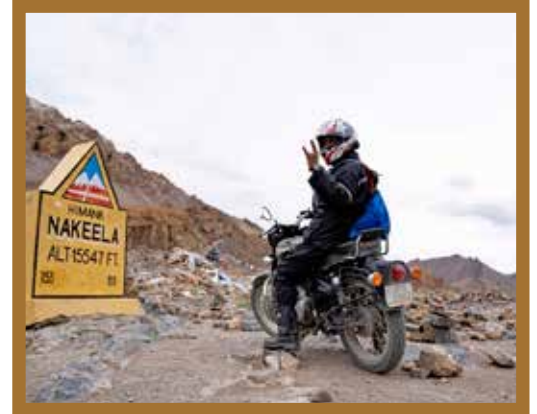
Shot at Nakeela (RNR Season 2021)