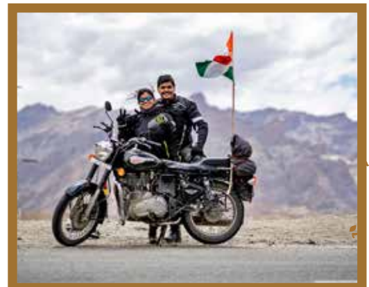
Shot at Sham Valley (RNR Season 2021)