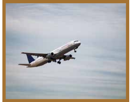
Shot at Delhi (RNR Season 2018)