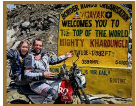
Shot at Khardung La (RNR Season 2021)