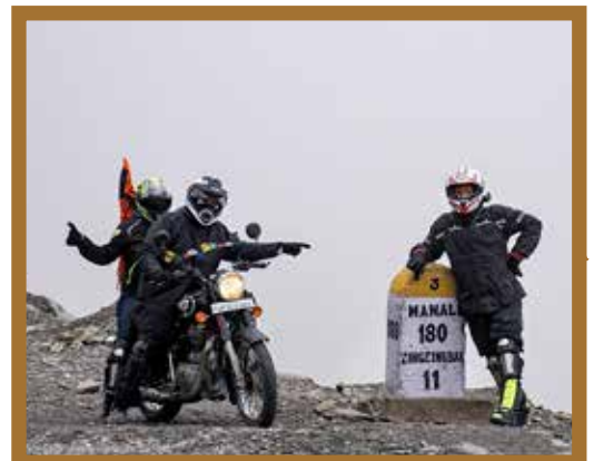
Shot near Zingzing Bar (RNR Season 2021)