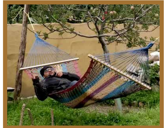
Shot at Manali (RNR Season 2021)