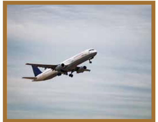
Shot at Delhi (RNR Season 2021)