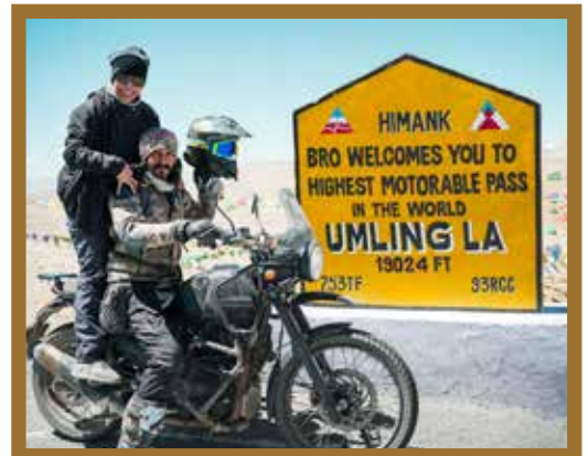
Shot at Umlingla (RNR Season 2023)