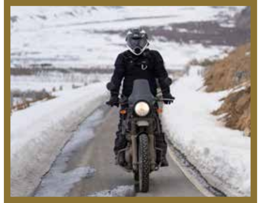
Shot at Tabo (RNR Season 2023)