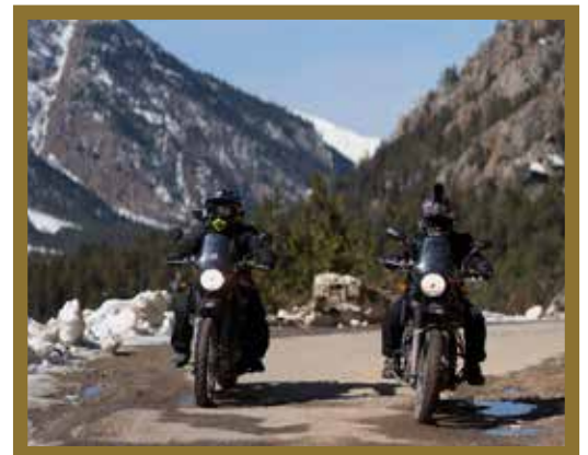
Shot at Chitkul (RNR Season 2023)