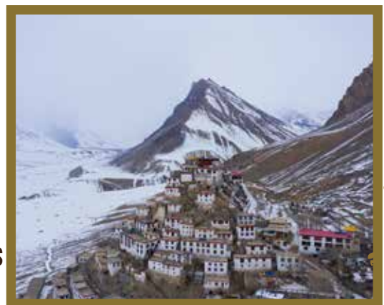
Shot at Kee (RNR Season 2023)