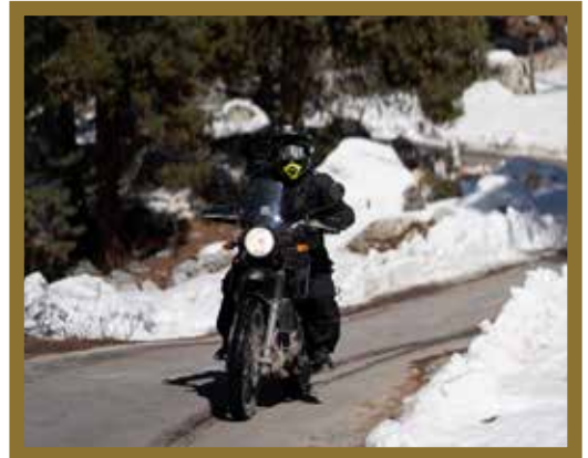
Shot at Theog (RNR Season 2023)