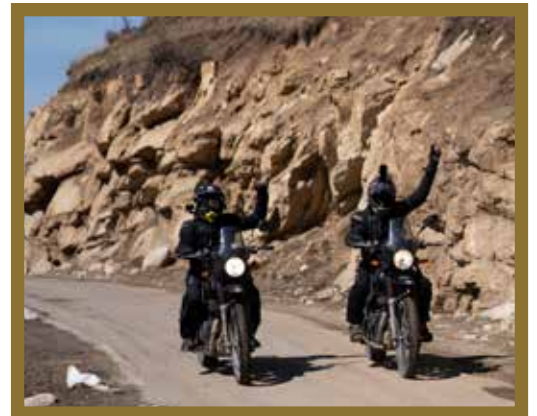
Shot at Narkanda (RNR Season 2023)