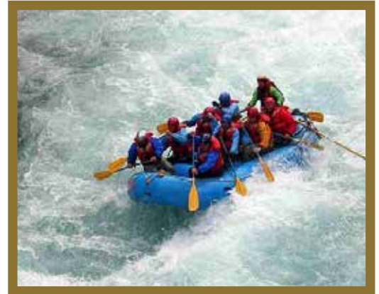
Shot at Rishikesh (RNR Season 2024)