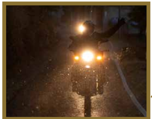
Shot at Dehradun (RNR Season 2023)