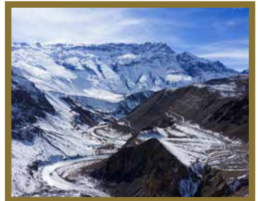
Shot at Nako (RNR Season 2023)