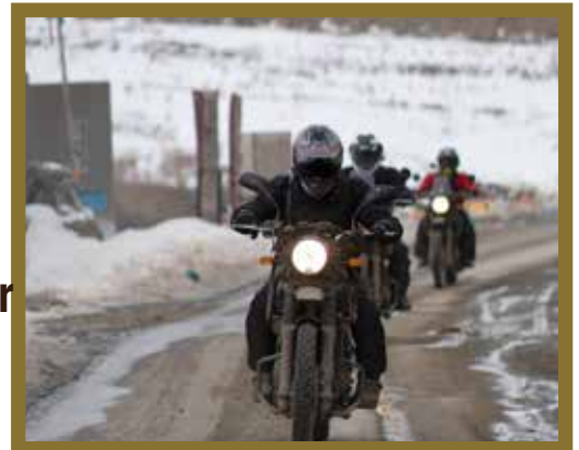
Shot at Kaza (RNR Season 2023)