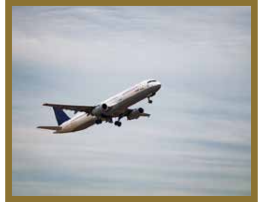
Shot at Delhi (RNR Season 2018)