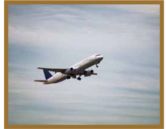
Shot at Delhi (RNR Season 2018)