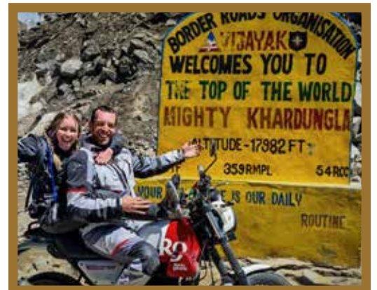
Shot at Khardung La (RNR Season 2021)