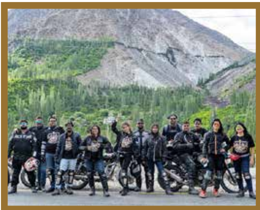
Shot at Kargil (RNR Season 2021)