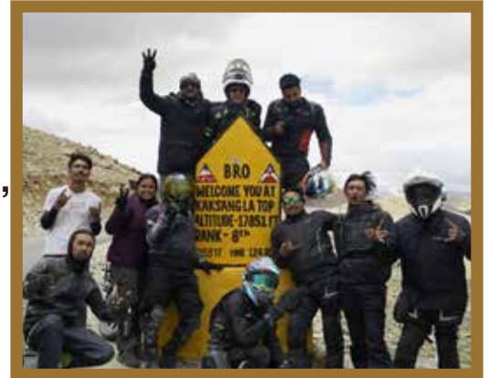
Shot at Kaksang La (RNR Season 2024)