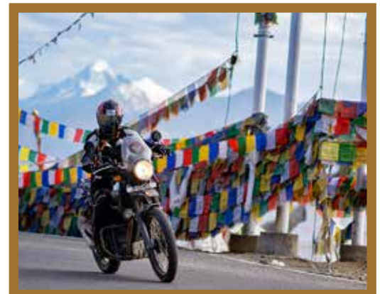
Shot at Shanti Stupa (RNR Season 2021)