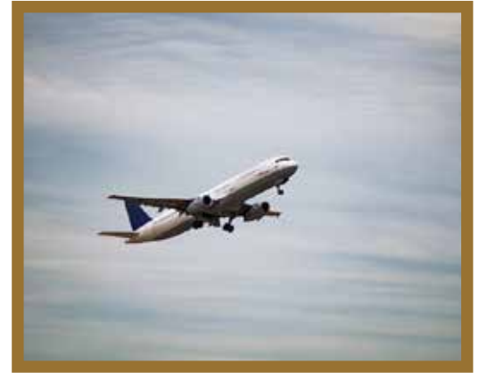
Shot at Delhi (RNR Season 2018)