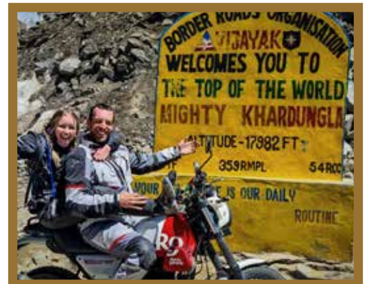
Shot at Khardung La (RNR Season 2021)