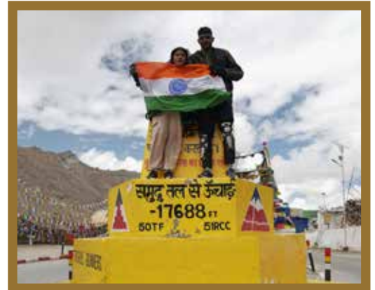
Shot at Chang La (RNR Season 2024)