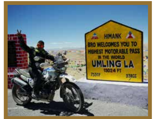
Shot at Umlingla (RNR Season 2023)

What we serve on a platter are very unique, untouched routes of unexplored Ladakh. The inclusion of Kaksang La Via Pangong and Umling La via Hanle is a classic example to prove this point. This less travelled route will give you that extra adrenaline rush that you have been dreaming for a while.