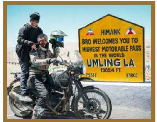
Shot at Umlingla (RNR Season 2023)