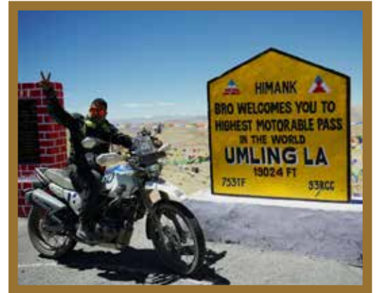
Shot at Umlingla (RNR Season 2023)

What we serve on a platter are very unique, untouched routes of unexplored Ladakh. The inclusion of Kaksang La route to Hanle, Umling La is a classic example to prove this point. This less travelled route will give you that extra adrenaline rush that you have been dreaming for a while.