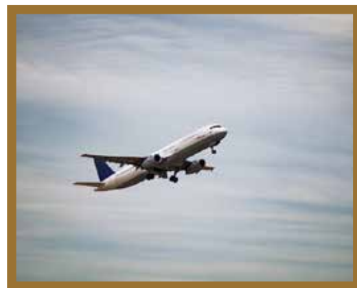
Shot at Delhi (RNR Season 2018)