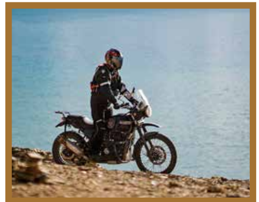
Shot at Tso Moriri (RNR Season 2021)