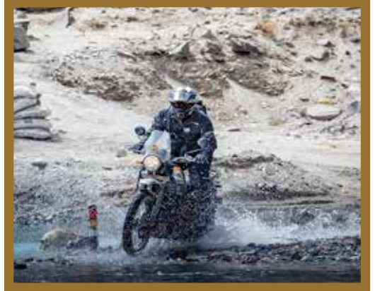
Shot in Shyok (RNR Season 2021)