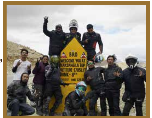
Shot at Kaksang La (RNR Season 2024)