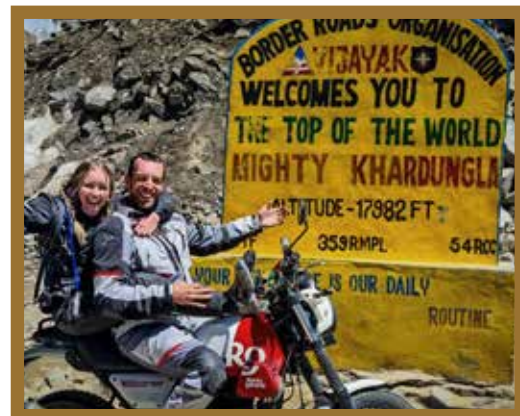
Shot at Khardung La (RNR Season,2021)