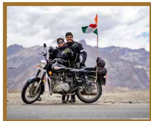
Shot at Sham Valley (RNR Season 2021)