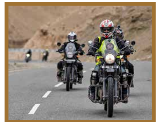
Shot near Karu (RNR Season 2021)