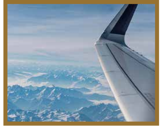
Shot at Ladakh (RNR Season 2021)