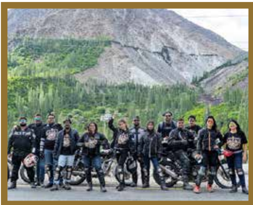
Shot at Kargil (RNR Season 2021)