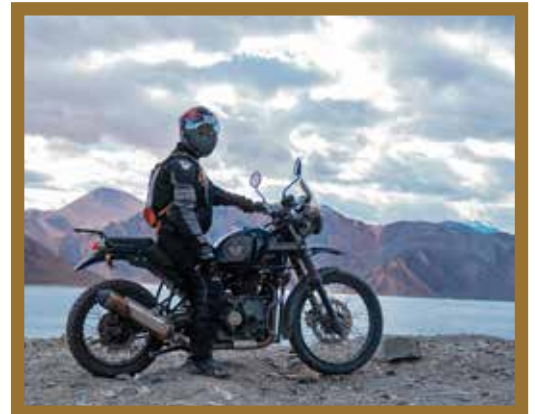
Shot at Pangong Tso (RNR Season 2021)