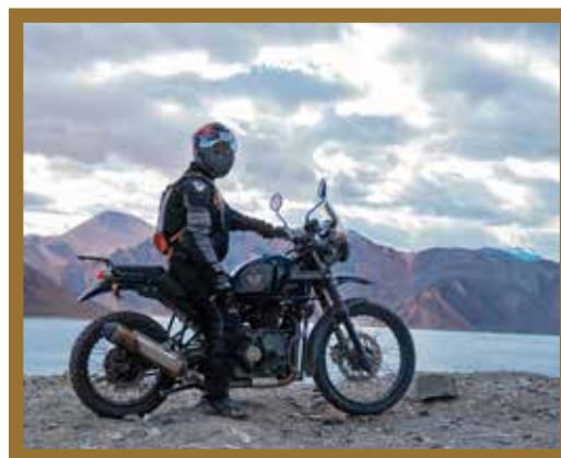
Shot at Pangong Tso (RNR Season 2021)