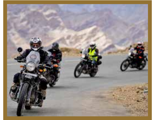
Shot at NH1 (RNR Season 2021)

We believe in EASY riding. We don't ride to race or rally, but to enjoy the beauty of the valley. SAFETY is our major concern. We urge riders to ride with proper safety gears, gloves & full face helmets only.