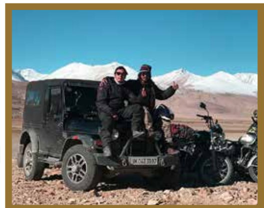
Shot at Hanle (RNR Season 2017)

Our whole team comprises of members from the mountains. The mighty himalaya is our motherland. So, be ready for a very unique riding experience as compared to any other tour agency in the market.