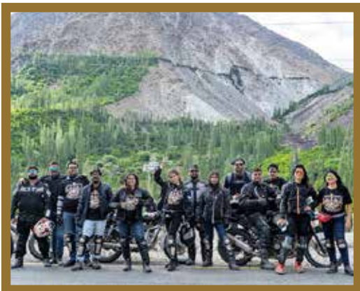
Shot at Kargil (RNR Season 2021)