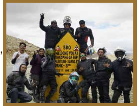
Shot at Kaksang La (RNR Season 2024)