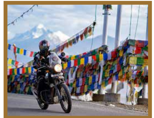
Shot at Shanti Stupa (RNR Season 2021)