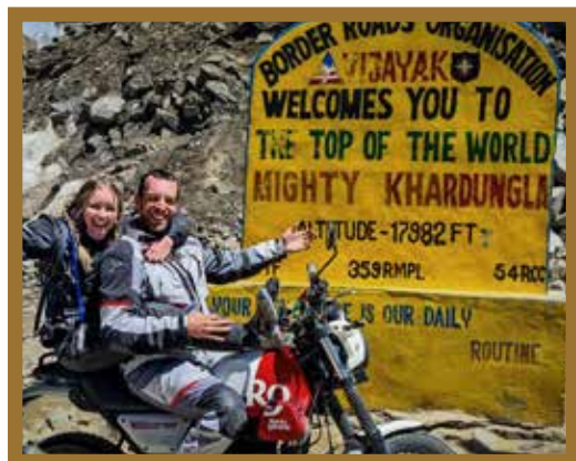
Shot at Khardung La (RNR Season 2021)