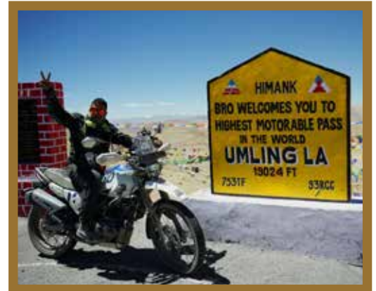
Shot at Umlingla (RNR Season 2023)

What we serve on a platter are very unique, untouched routes of unexplored Ladakh. The inclusion of Kaksang La Via Pangong and Umling La via Hanle is a classic example to prove this point. This less travelled route will give you that extra adrenaline rush that you have been dreaming for a while.