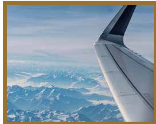
Shot at Ladakh (RNR Season 2021)