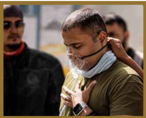
Shot at Tangtse (RNR Season 2021)

We take preventive measures for AMS i.e. Acute Mountain Sickness. We keep oxygen cylinders & first aid kit with us in order to minimize any health issues arising at higher altitudes. (3500-5500 mtrs)