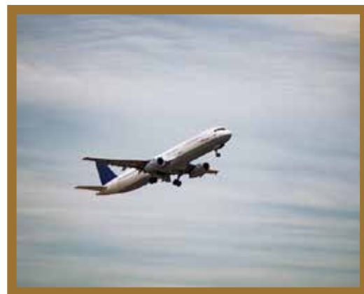
Shot at Delhi (RNR Season 2018)