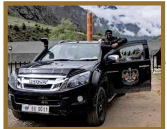
Shot at Jispa (RNR Season 2021)

We always keep a four wheeled support vehicle for on-the-go convenience. It can either be an iSuzu or a Mahindra vehicle. This carries your luggage, oxygen cylinders, extra petrol, mechanical support & spare parts for a worry-free riding experience.