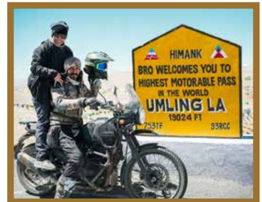
Shot at Umlingla (RNR Season 2023)